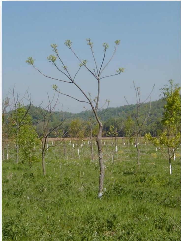
Figure 1. Repeated terminal leader failure in an open grown black walnut seedling. Four consecutive years of terminal failure can be seen. The lower two have been pruned, and are now just crooks.

There is an easy solution to this problem, trainers . There is a hard and inferior solution, manual pruning .