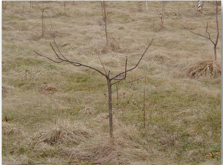
Figure 4. A stunted black walnut seedling being smothered by tall fescue. Not only are the stunted dwarfs small, the become extremely crooked.

We had about 30 acres of trees that looked like Figure 4. At a Walnut Council meeting at the University of Nebraska, we saw test plots showing how suppressing tall fescue could be. I came home and sprayed glyphosate out to the drip line of all the trees. The next summer they took off growing so fast that several broke off from the weight of new foliage.